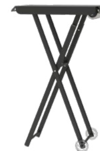
Nero / Black