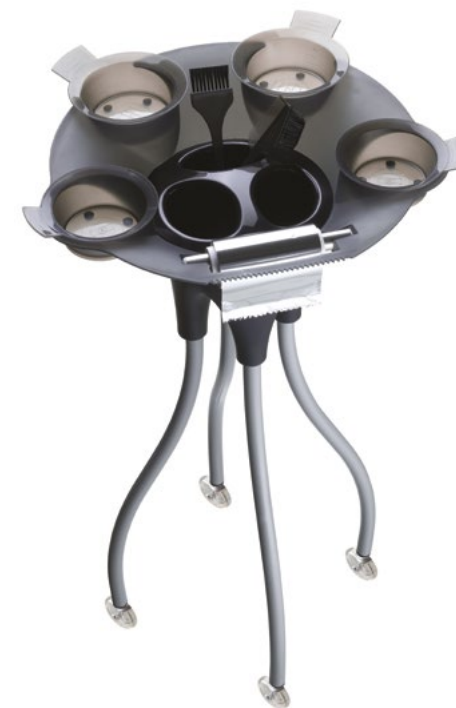
Nero / Black