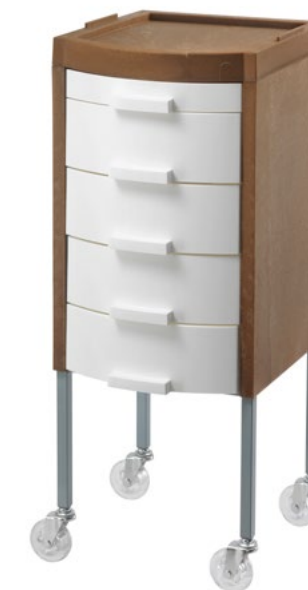
Bianco / White