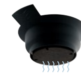
Sistema magnetico Magnetic system