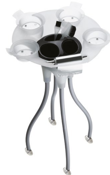
Bianco e nero / White and black