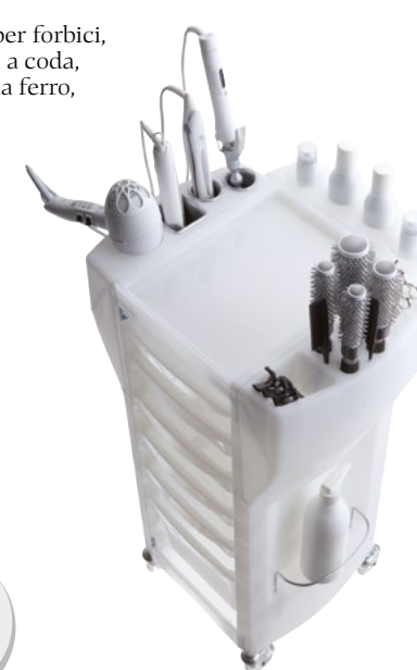
Bianco / White