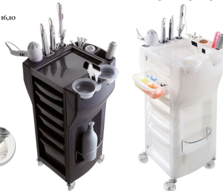
Grigio scuro / Dark grey

Service trolley. Colouring + styling. Hair-free Speedy Wheels.