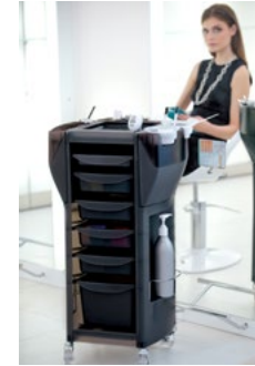
Upgrade Styling / Upgrade Colouring