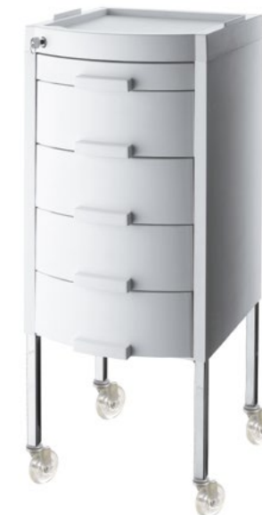
Bianco / White