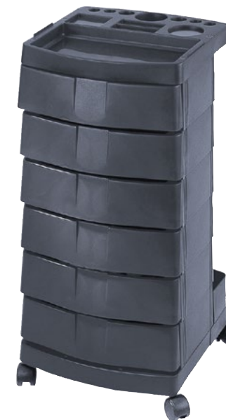
Grigio scuro / Dark grey

Professional trolley, dark grey plastic structure. Professional top. 6 removable drawers. Hair-free Gonzales wheels.