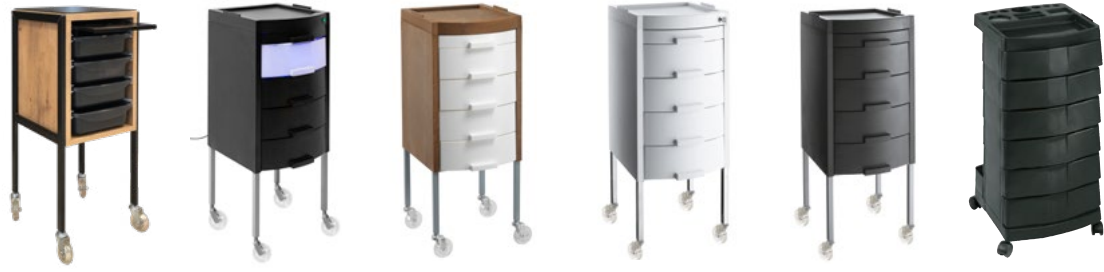
Coney Island 5 UVC Manhattan 7 Manhattan Eco 9 Manhattan Key 11 Manhattan 11 Classic 13