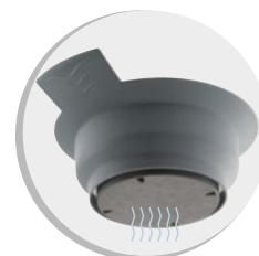
Sistema magnetico Magnetic system