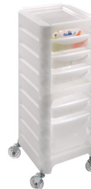
Bianco / White