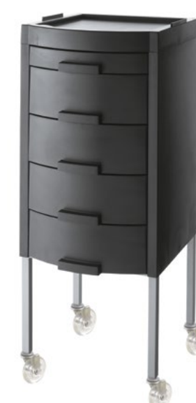
Nero / Black