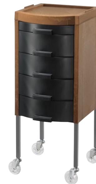
Nero / Black