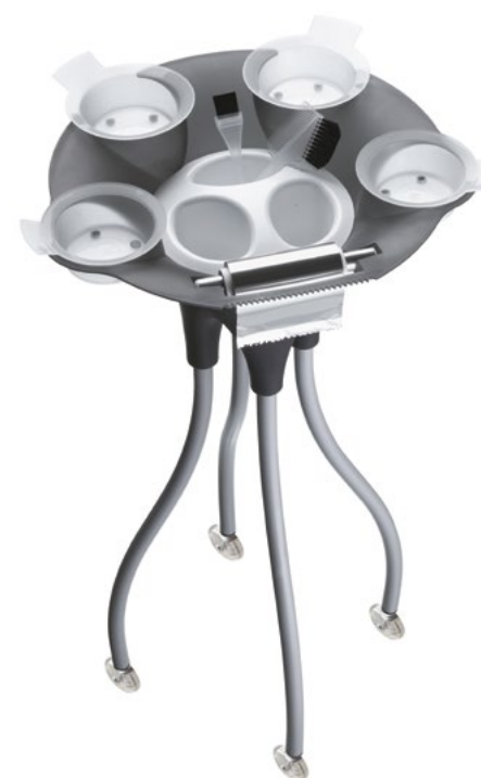
Nero e bianco / Black and white