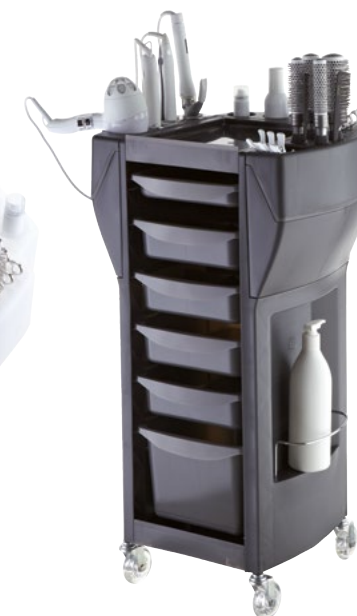
Grigio scuro / Dark grey