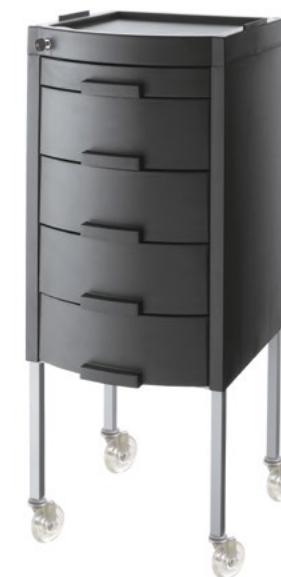
Nero / Black