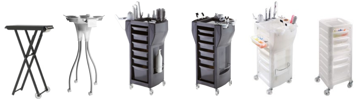
Just Color 15 Jelly Fish 17 Upgrade Styling 19 Upgrade Colouring 19 Upgrade Mix 21 Upgrade Easy 21