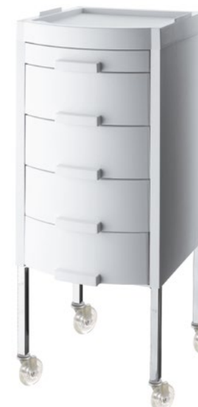
Bianco / White