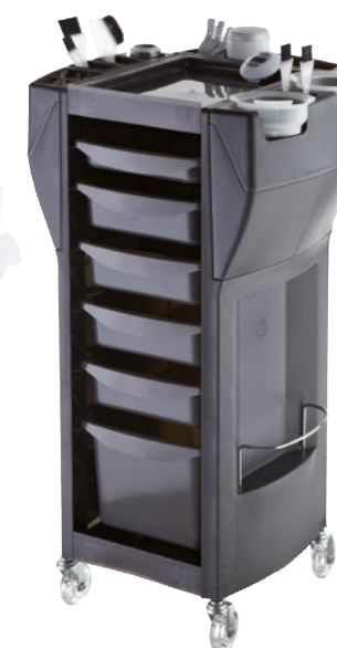
Grigio scuro / Dark grey