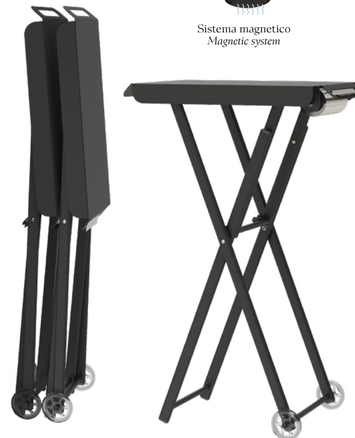
Colori disponibili / Available colours