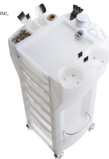
Bianco / White