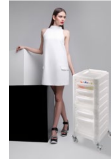
Upgrade Mix / Upgrade Easy