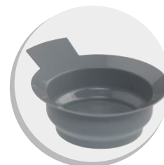
2 ciotole incluse 2 bowls included

Magnetic service folding trolley with 2 bowls included.